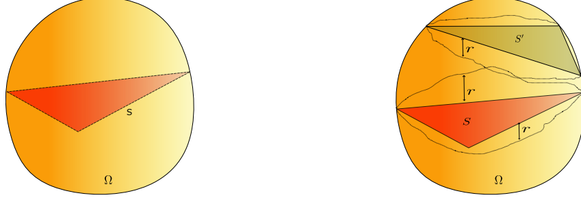
FIGURE 2. The figure on the left is a maximal properly embedded 2-simplex. The figure on the right is the illustration of the condition: strongly isolated simplices .

Theorem 1.4 ([IZ23, Theorem 1.7]). Suppose \Omega \subset \mathbb{P}(\mathbb{R}^d) is a properly convex domain, \Gamma \leq \text{Aut}(\Omega) is a convex co-compact group, and \mathcal{S}_\Gamma is the family of all maximal properly embedded simplices in \mathcal{C}_\Omega(\Gamma) of dimension at least two. Then the following are equivalent: